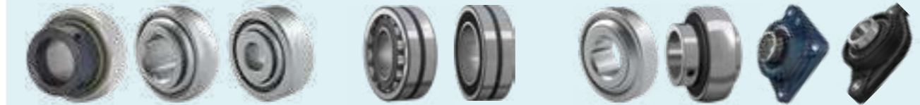
Head Feederhouse / Rotor Clean Grain / Residue