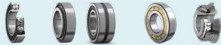
DGBB explorer TRB explorer CRB explorer Pinion unit