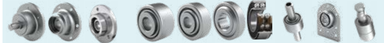
Agri HUB Disc opener Seedmeter drive shaft Gauge wheel