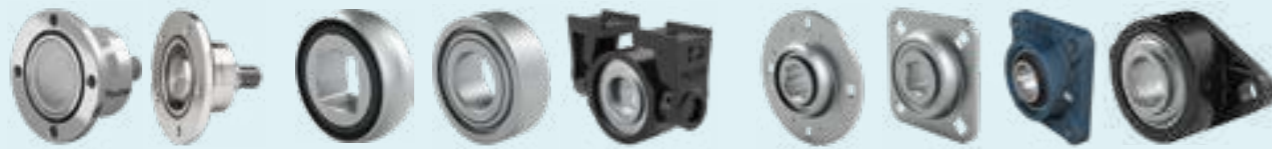
Agri Hub range Gang disc Seedbed finisher